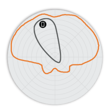
Figure 4. T750 2.4GHz Elevation Antenna Patterns