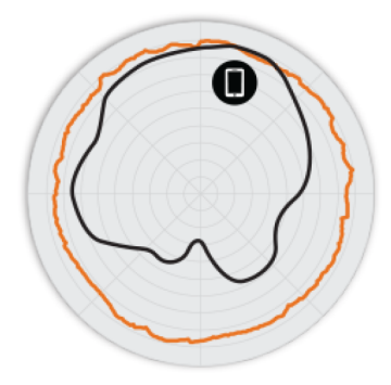
Figure 2. T750 2.4GHz Azimuth Antenna Patterns