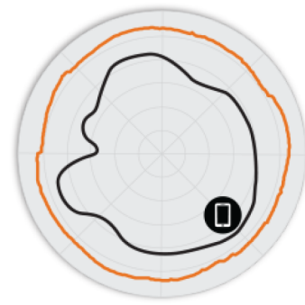
Figure 3. T750 5GHz AzimuthAntenna Patterns