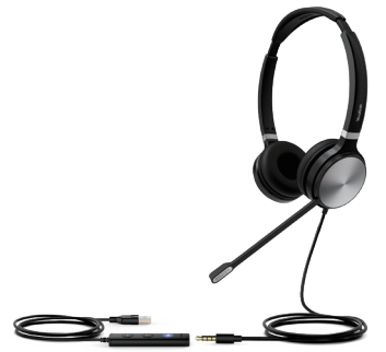
UH36 Dual Teams UH36 Dual UC