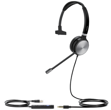
UH36 Mono Teams UH36 Mono UC

Deeply integrated with Yealink IP phones that the advanced features, such as volume synchronization and multiple calls control, are just right at your fingertips.