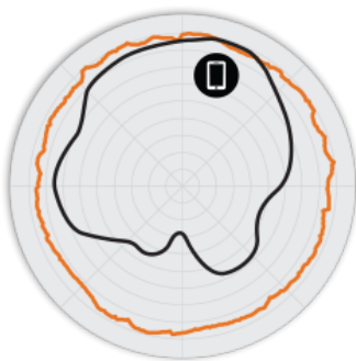
Figure 2. R750 2.4GHz AzimuthAntenna Patterns