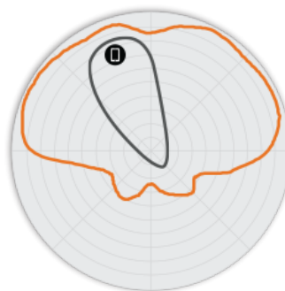
Figure 4. R750 2.4GHz Elevation Antenna Patterns