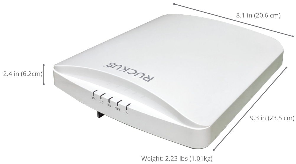
Weight: 2.23 lbs (1.01kg)