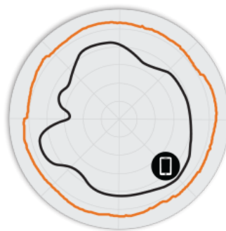
Figure 3. R750 5GHz AzimuthAntenna Patterns