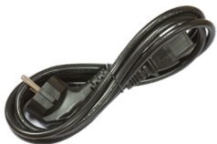
IEC C5 cord